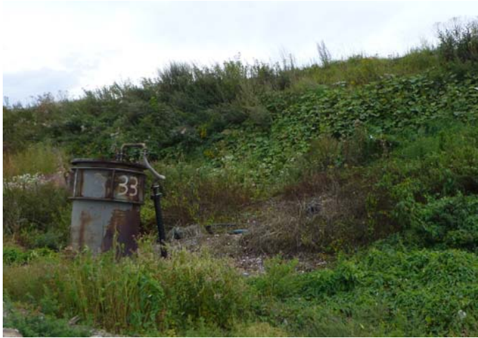
Figure 1: Measurable surface emissions with changes in the vegetation