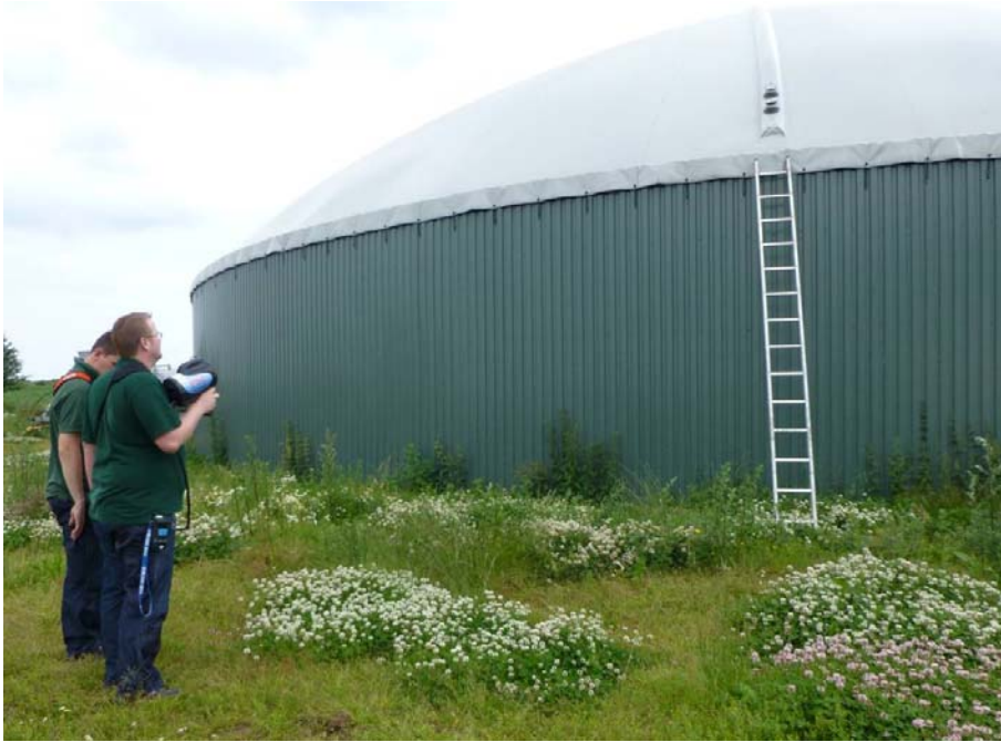
Figure 9: Leak check at the roof of the inflatable structure of a biogas plant