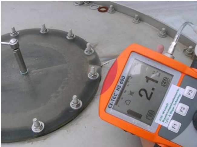
Figure 8: Leak measurement using the semi-conductor technology (not FID) at the one-foil roof of a biogas plant fermenter (gasholder)