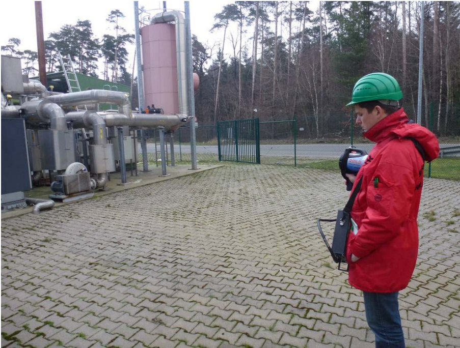
Figure 13: Methane detection at the technical plants and gas pipes of an MBT