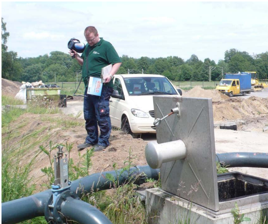
Figure 10: Leak test at random in a biogas plant