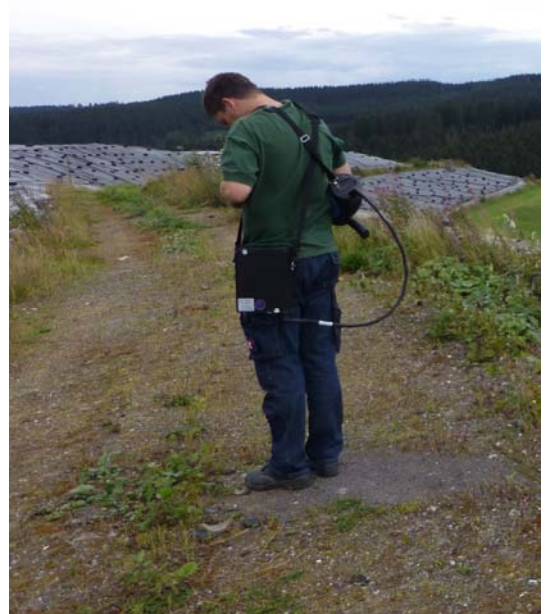
Figure 2: Fast methane detection, also on the roadways

In addition to this "new" measuring method, DAS-IB GmbH already implemented a comparison between the conventional FID measurement and a selective semiconductor in 2009. Ever since, it was shown in numerous practical measurements that a selective semiconductor – due to its measurement free from fuel gas and the lower purchase, operating and maintenance costs – represents an equivalent measuring method to the conventional FID measurement. The disadvantages of selective semiconductors are the cross sensitivities, e.g. to hydrogen and humidity (avoidance through the corresponding measurement set-up / sets).