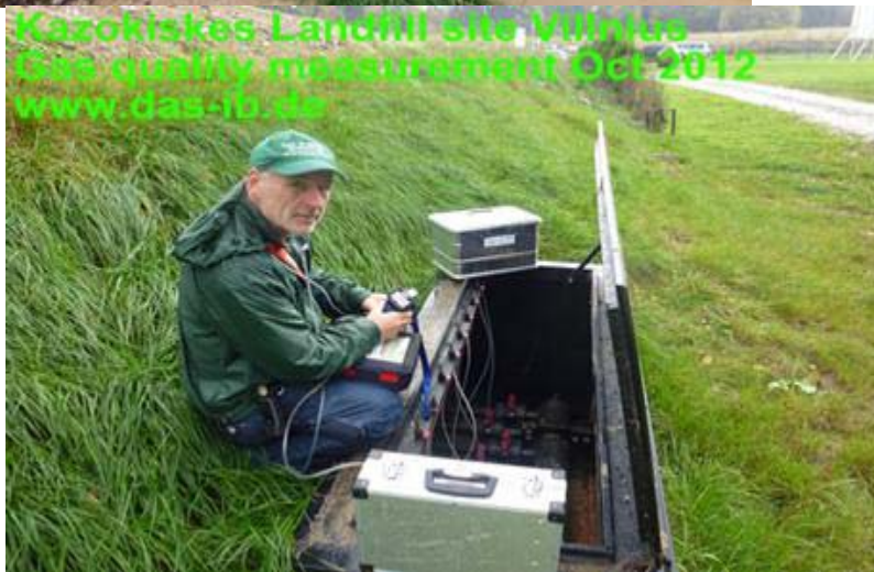
Figures 4 and 5: Surface emissions and double-check at the manifold station, Kazokrates landfill site (Lithuania, Vilnius)