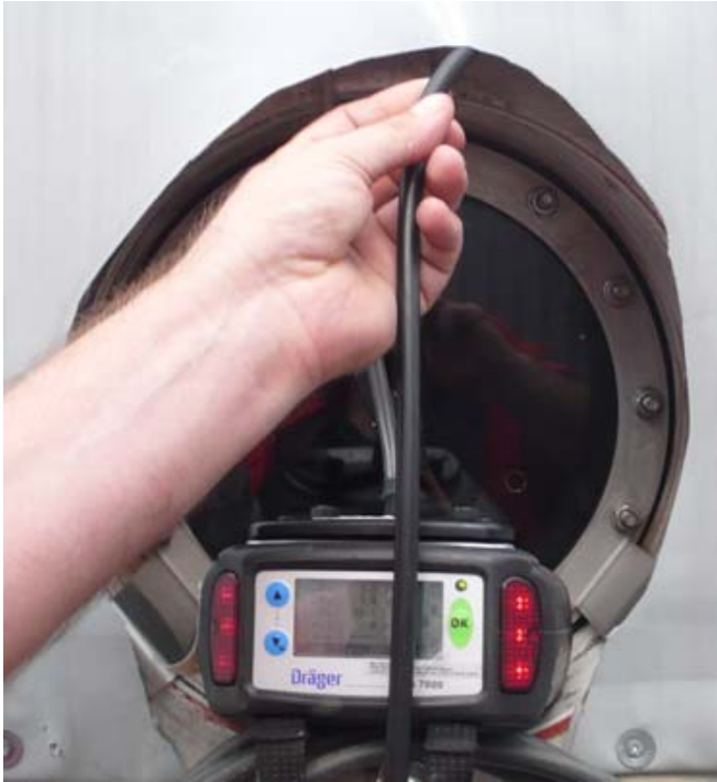
Figure 7: Not in this way! Operator protection / personal security measuring device for the leak test – but the plant is leaky!

What do you, as the user (operator), need to observe?