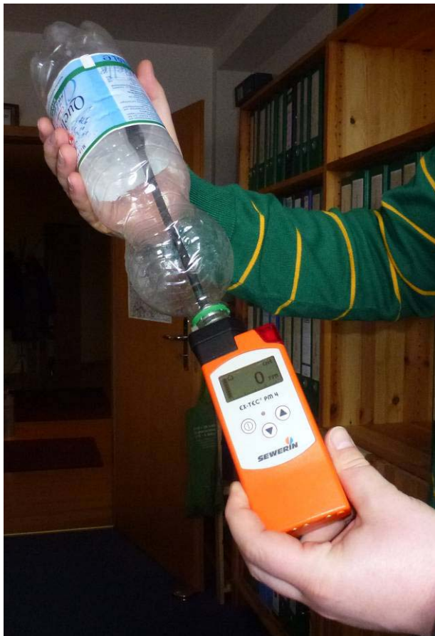
Figure 15: "Bottle test" at leak measuring devices for the determination of pressure and cross sensitivities