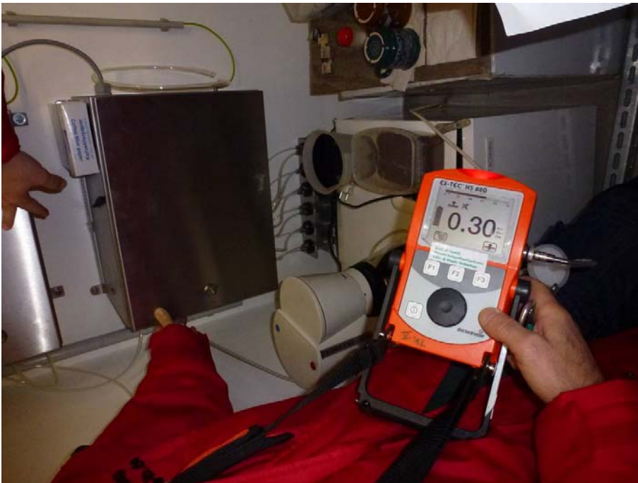
Figure 14: Methane emissions in a valve unit of a raw / crude gas analysis device of a biogas