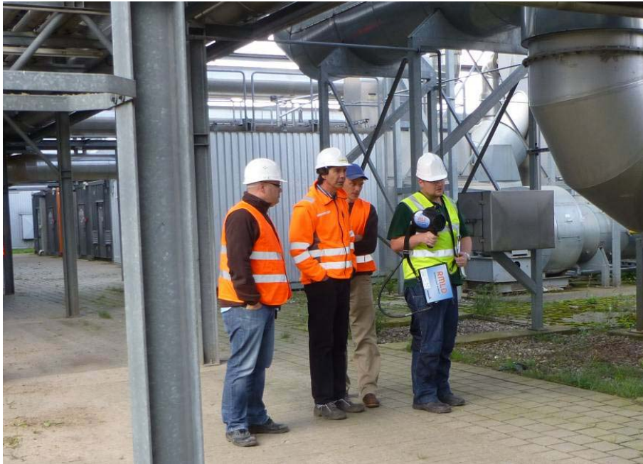
Figure 11: Methane detection at an MBT