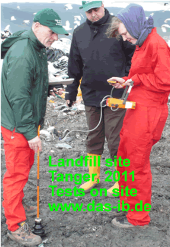
Figure 6: Surface emissions Morocco – Tangier landfill site